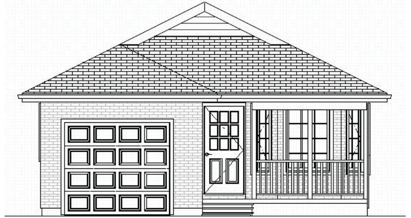
"The Danika 'A'"

Plans and dimensions are approximate and subject to change at the discretion of Barr homes. Actual usable floor space may vary from the stated floor area. The mechanical room layout is at the discretion of the mechanical contractors