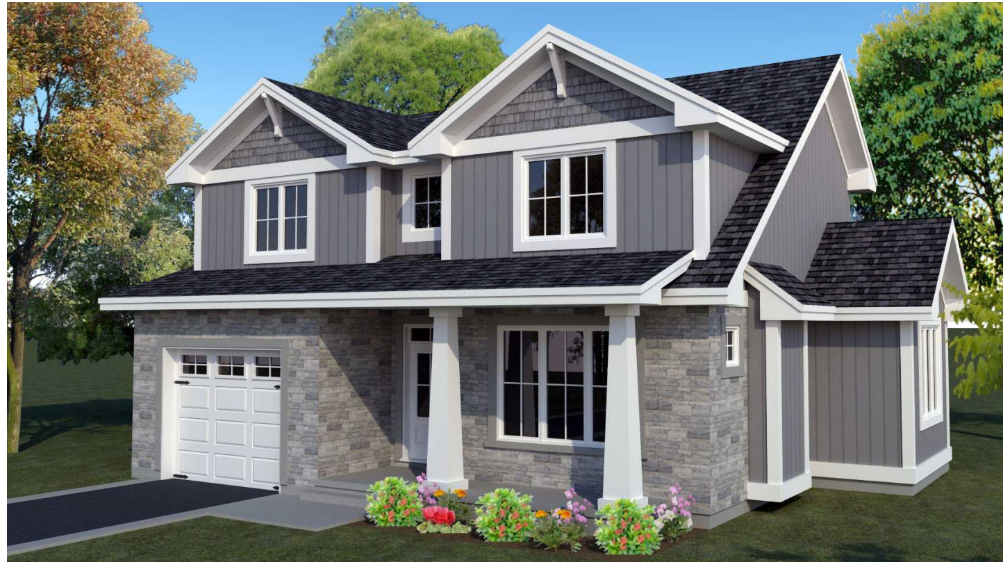
Optional Elevation add $5500 - Not exactly as illustrated

The Watson is a two story home with plenty of curb appeal and exterior design flexibility. This unique design has plenty of space for family living with three bedrooms and two and a half baths.